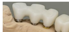
Zr bridge over implants