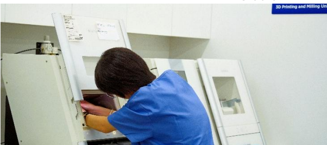
High-precision Milling Systems