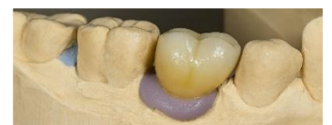
PFM crown over Ti abutment