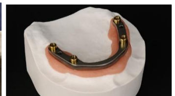
Milled Ti bars with locators