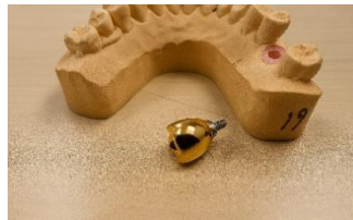
Implant gold crowns