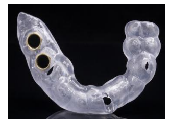
Planned surgical guides