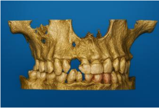
Implant Planning Studio