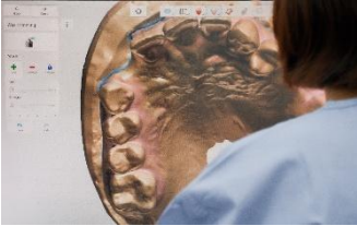
Digital CAD/CAM Design