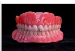
Advanced Denture Studio